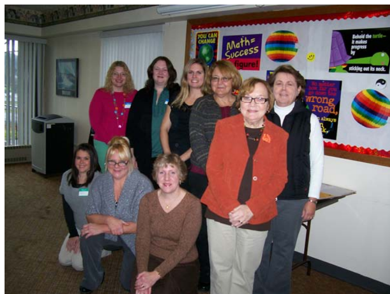
Jefferson-Clarion Family Literacy Staff